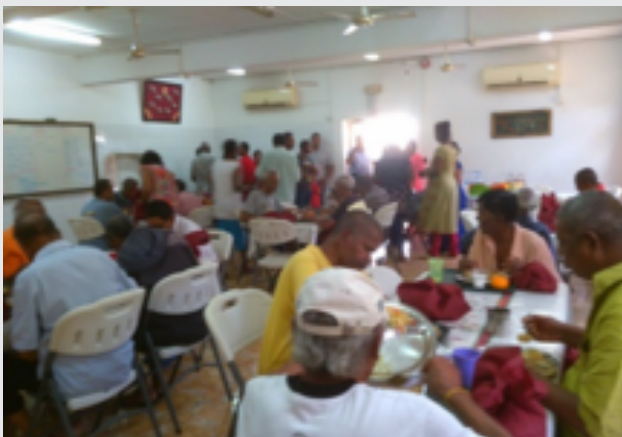
The residents of Swami Krishnanand having lunch in the mess room.