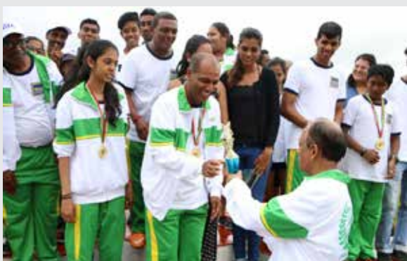
The Chairman awarded the medals and shield to the winning team of the treasure hunt.