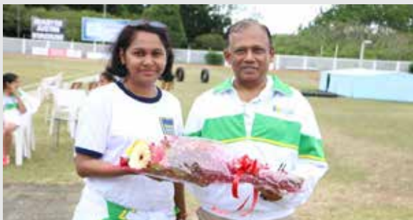
For the other events the medals were awarded by the officers at the management level.